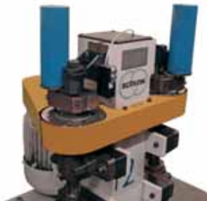
Pin-on-disc test rig

Whether basic examinations are required or specific application “endurance” tests, examinations of whether components should be run lubricated or technically dry – our air conditioned rooms make everything possible.