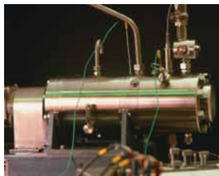
Test rig for blister tests with highly viscous oils as the medium to be sealed