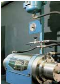
Seal ring test rig

Put us to the test – and we'll find a solution to your tribological problem too!